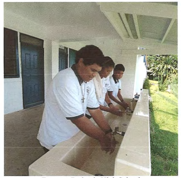
Emmaus Bethania High School