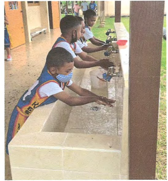
Koror Elementary School