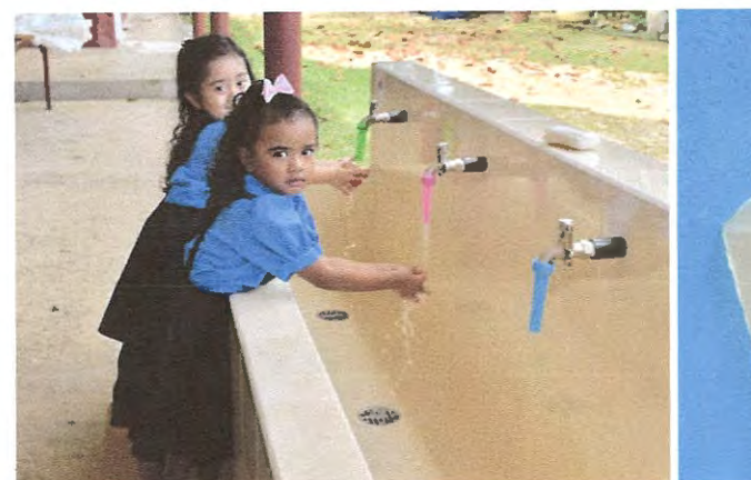
PEC Gospel Kindergarten