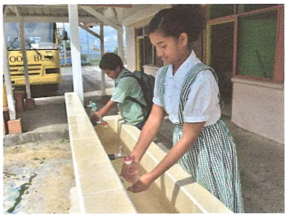
Meyuns Elementary School