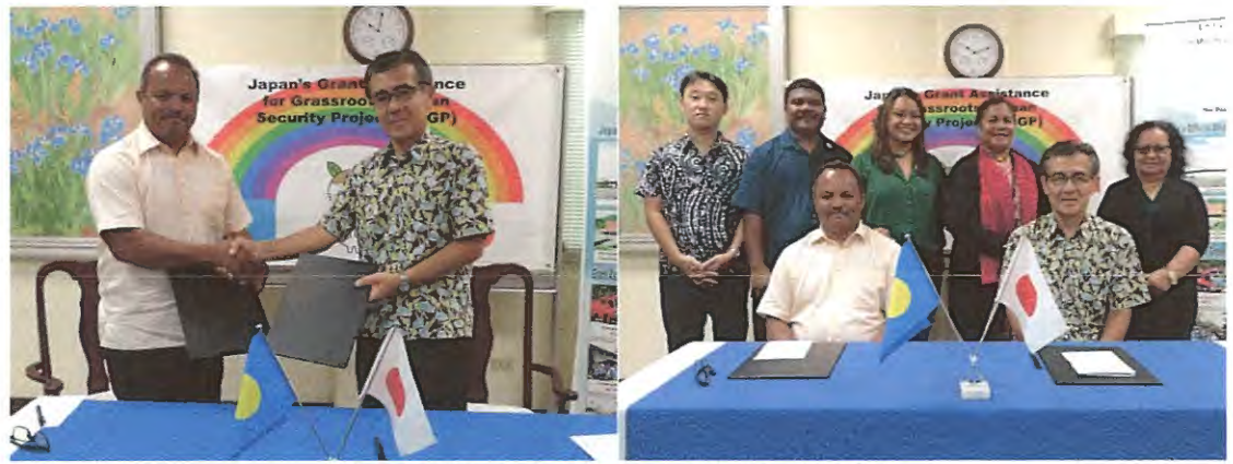
Signing of the Grant Contract on October 22, 2020

The Embassy of Japan in the Republic of Palau awarded the sum of $269,985.00 to the Ministry of Education (MOE) for the facilitation of hand-wash stations pursuant to a Grant Contract executed between the Embassy of Japan and the Ministry of Education on October 22, 2020, as shown below: