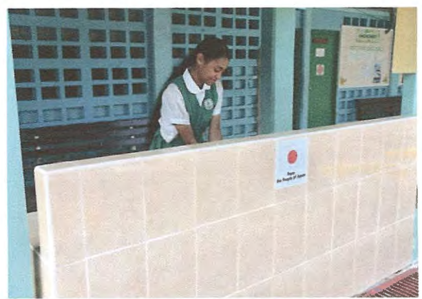
Maris Stella School