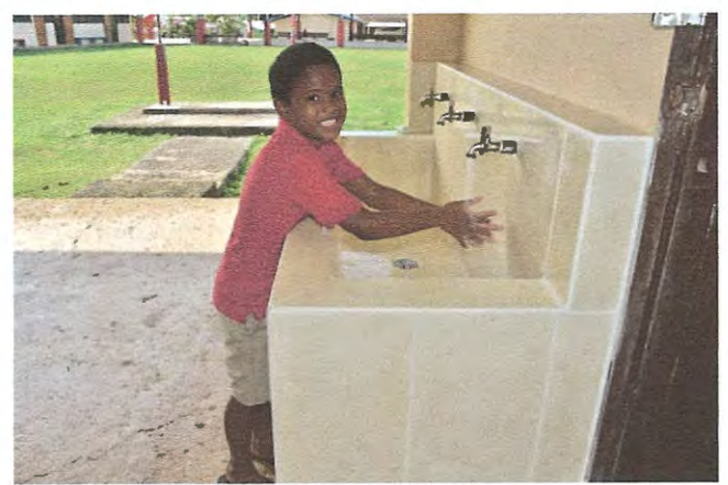
George B. Harris Elementary School