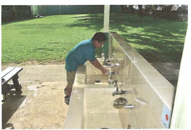
Seventh Day Adventist Elementary School