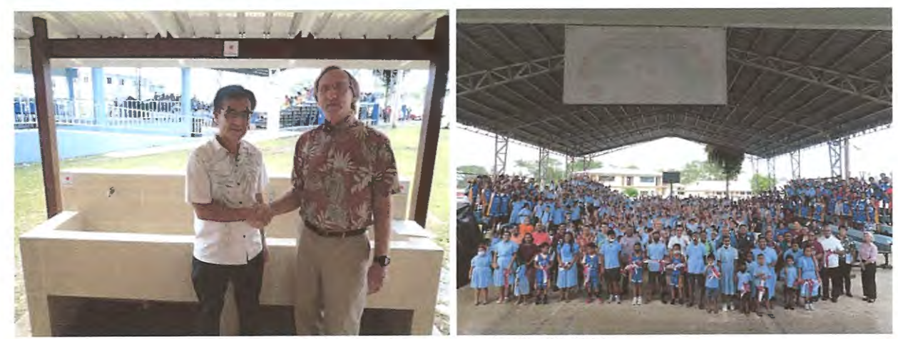
Handover Ceremony on October 15, 2021

The hand-wash stations were turned over to the Ministry of Education in a formal handover ceremony on October 15, 2021, as shown below: