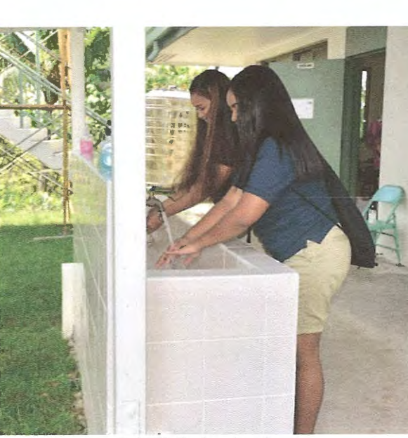
Palau Mission Academy