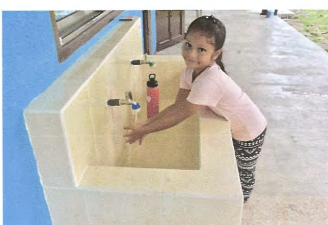
Ngermid Head Start Center